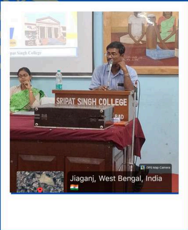
Jiaganj, West Bengal, India