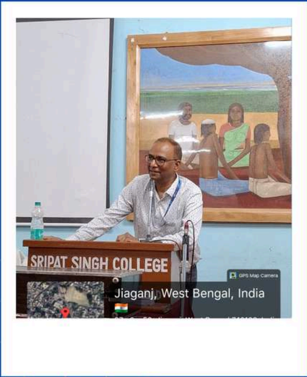
Jiaganj, West Bengal, India