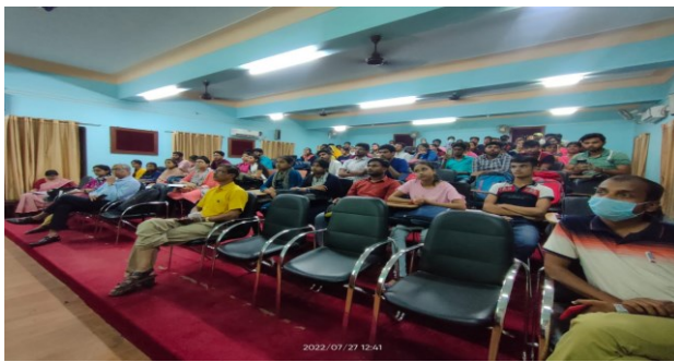
Participants attending the seminar speech