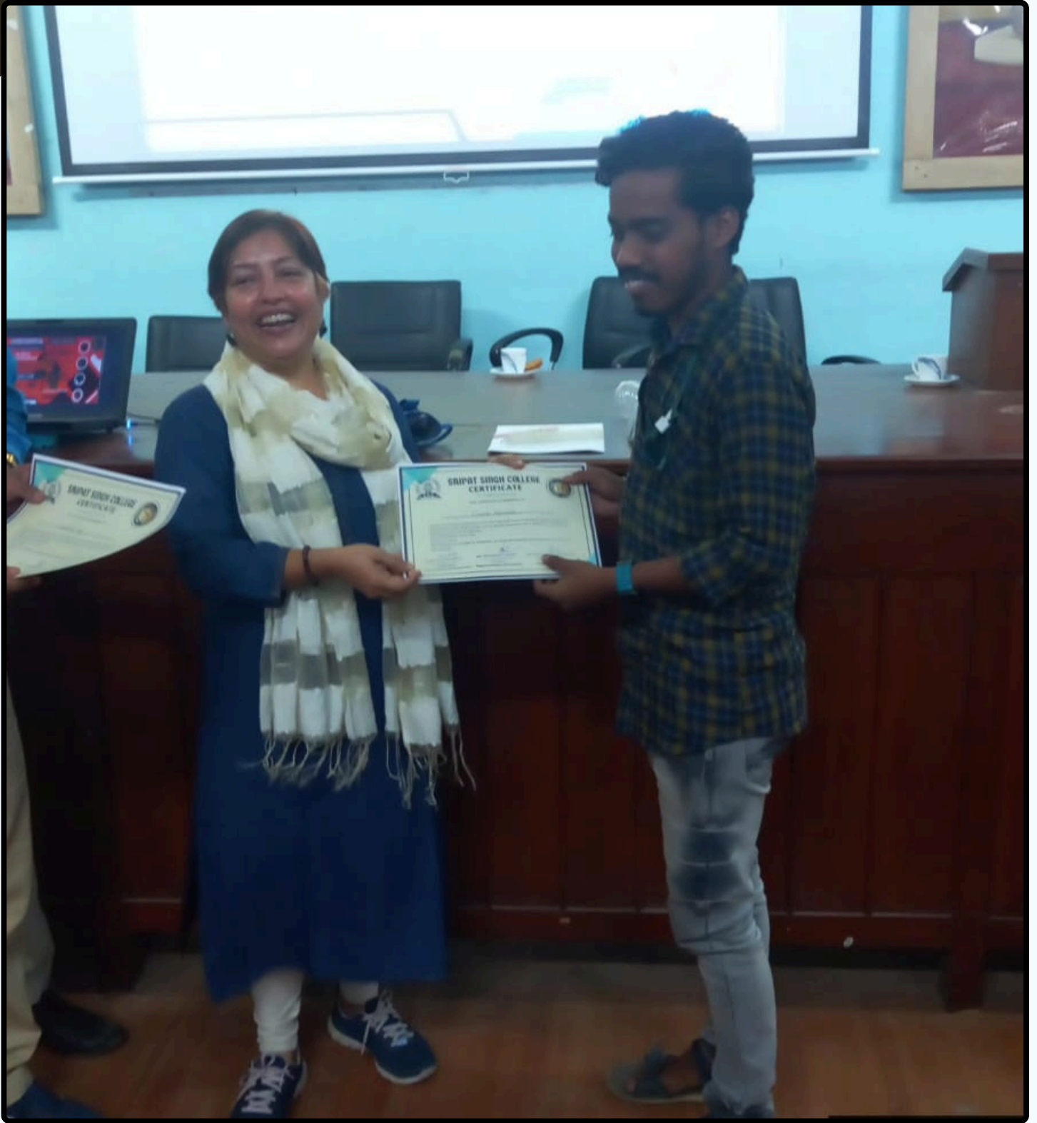
Glimpses of moment