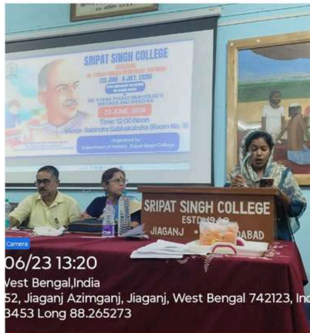
Camera 06/23 13:20 West Bengal, India 52, Jiaganj Azimganj, Jiaganj, West Bengal 742123, India 88.2653 Long 88.265273