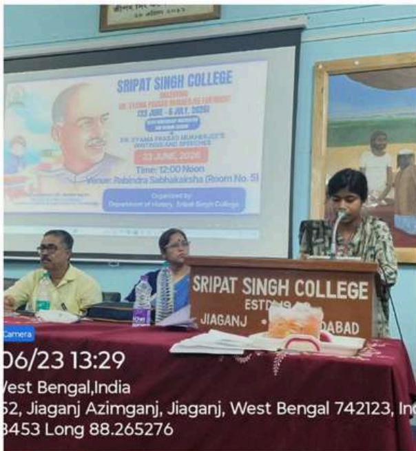
06/23 13:29 West Bengal,India 52, Jiaganj Azimganj, Jiaganj, West Bengal 742123, India 8453 Long 88.265276