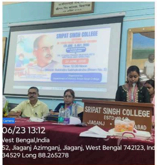
06/23 13:12 West Bengal,India 52, Jiaganj Azimganj, Jiaganj, West Bengal 742123, India 84529 Long 88.265278