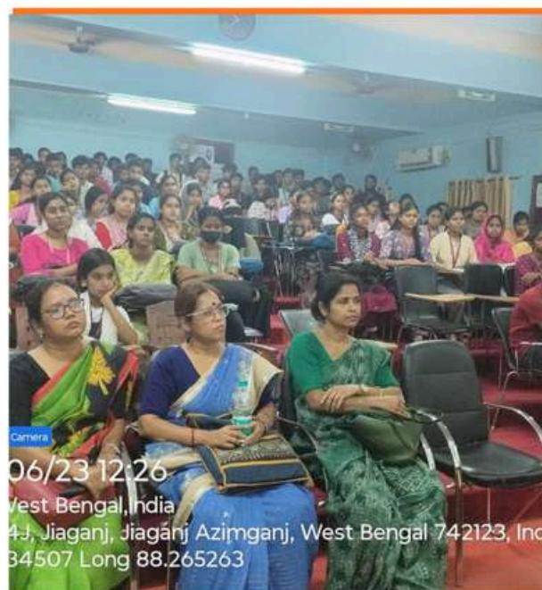
Camera 06/23 12:26 West Bengal, India 52, Jiaganj, Jiaganj Azimganj, West Bengal 742123, India 88.26507 Long 88.265263