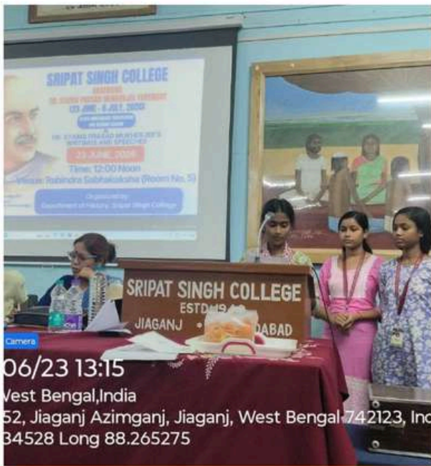
06/23 13:15 West Bengal,India 52, Jiaganj Azimganj, Jiaganj, West Bengal 742123, India 84528 Long 88.265275