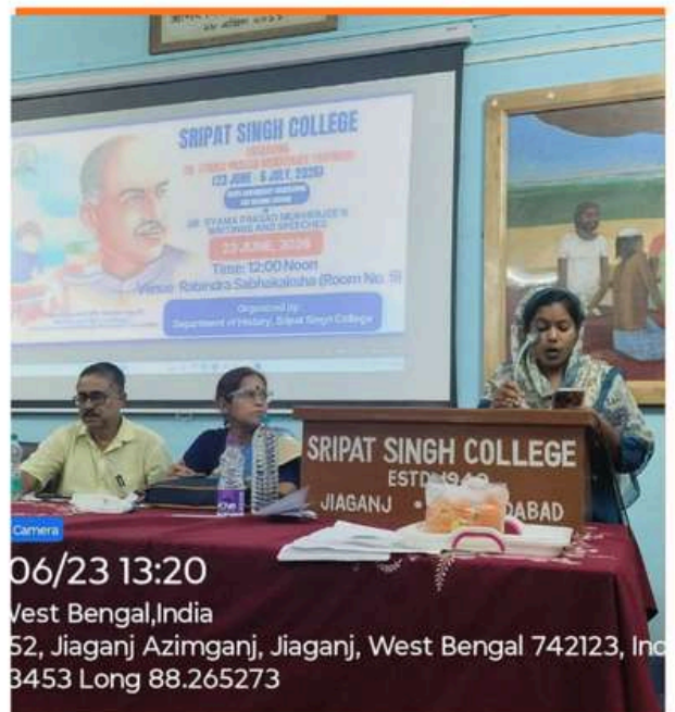
06/23 13:20 West Bengal,India 52, Jiaganj Azimganj, Jiaganj, West Bengal 742123, India 8453 Long 88.265273