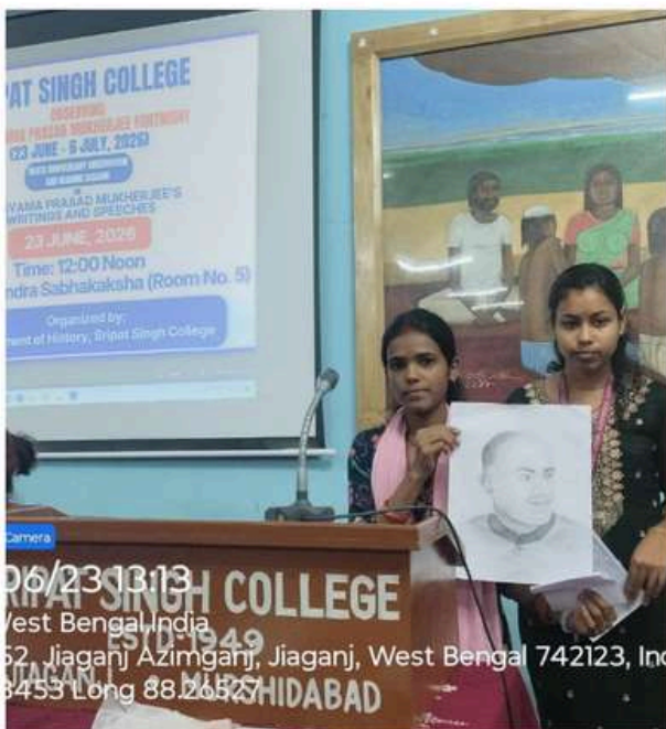
Camera 06/23 13:13 West Bengal, India 52, Jiaganj Azimganj, Jiaganj, West Bengal 742123, India 88.2653 Long 88.265273