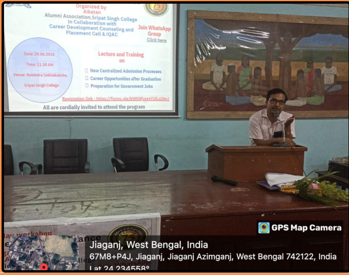
Glimpses of moment