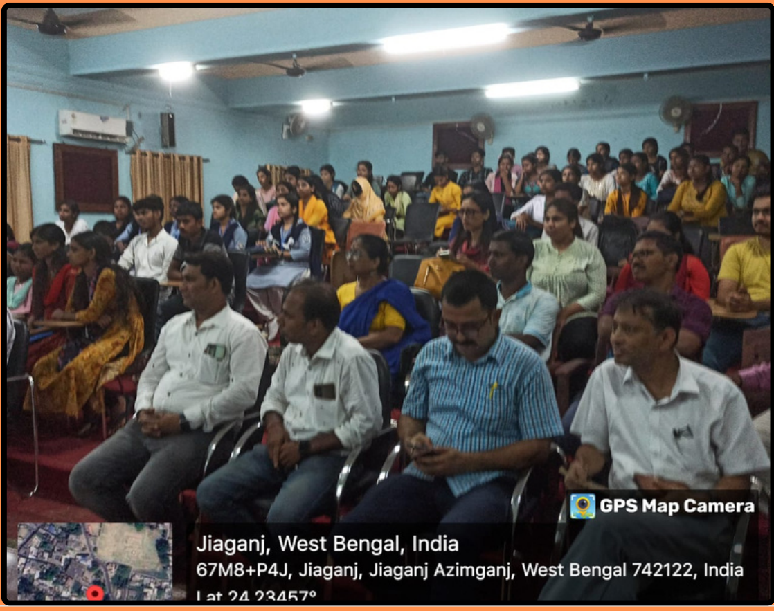
Glimpses of moment