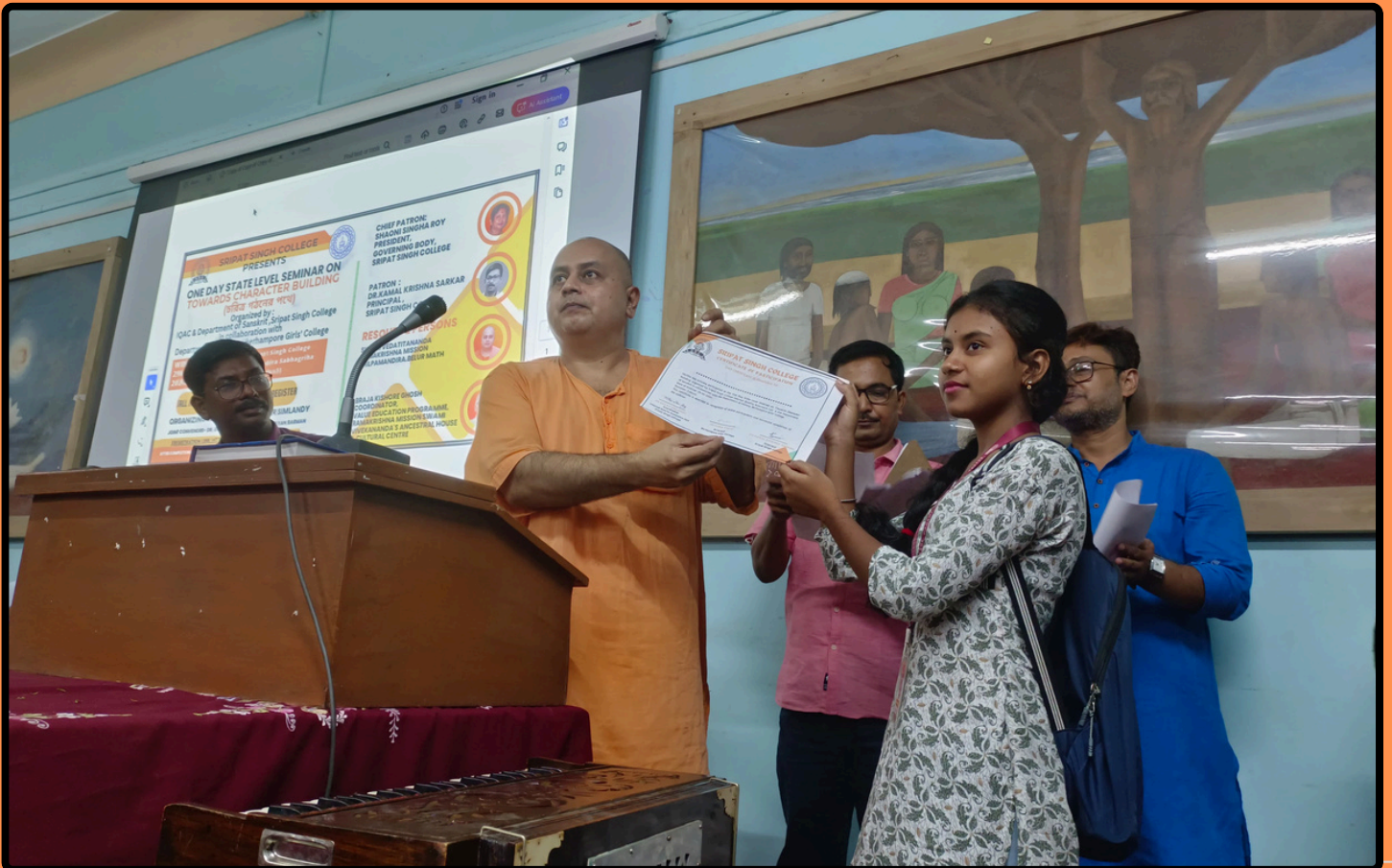
Glimpses of moment