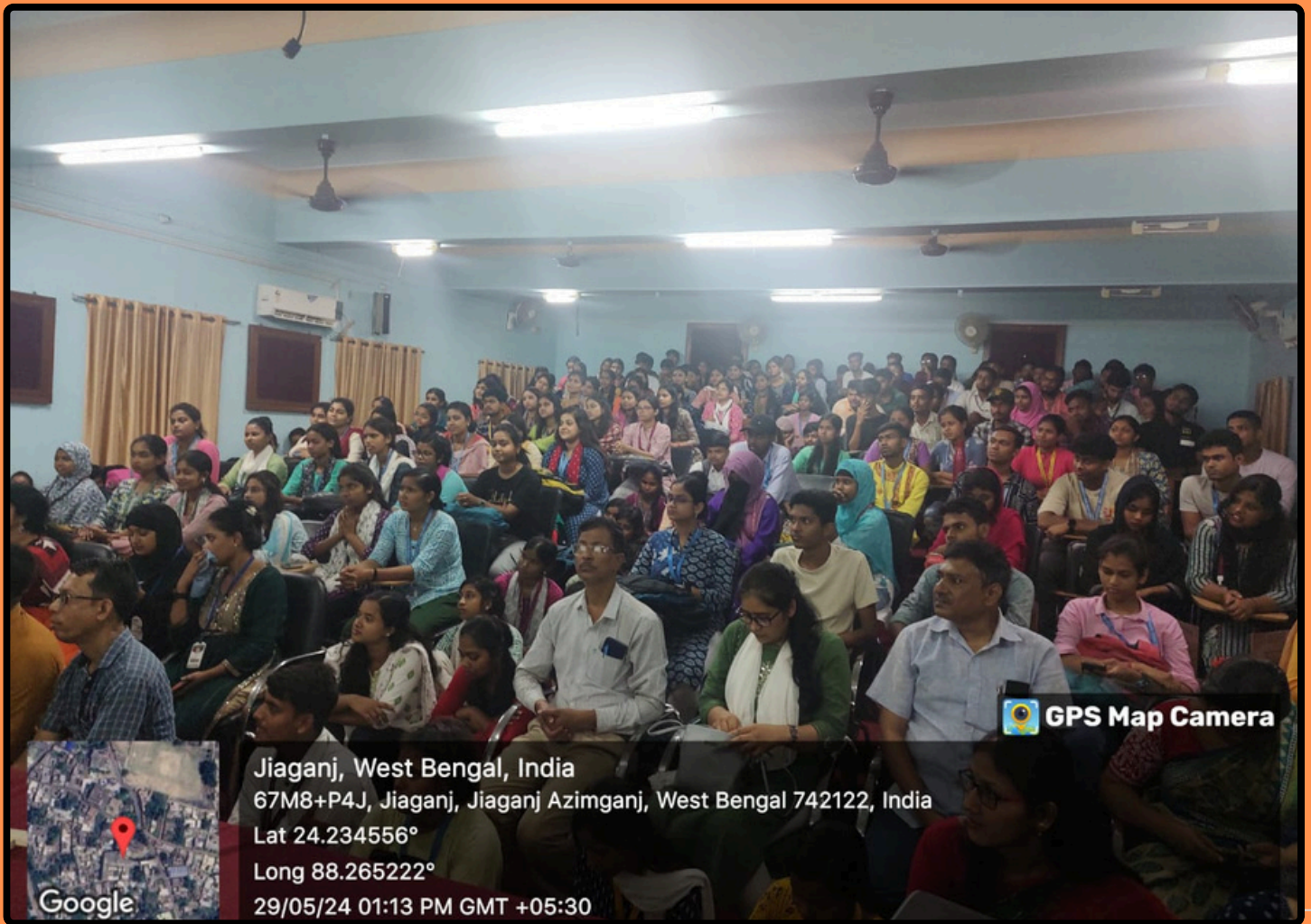
Glimpses of moment