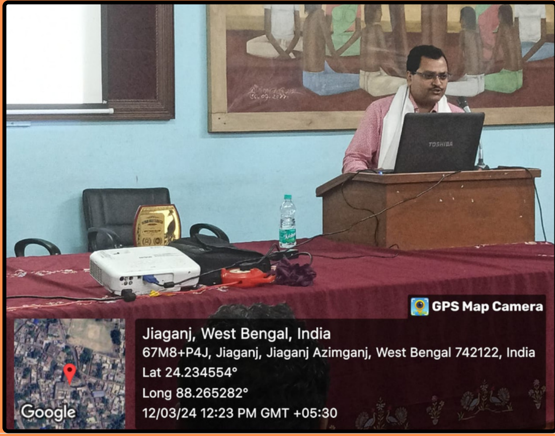
Glimpses of moment