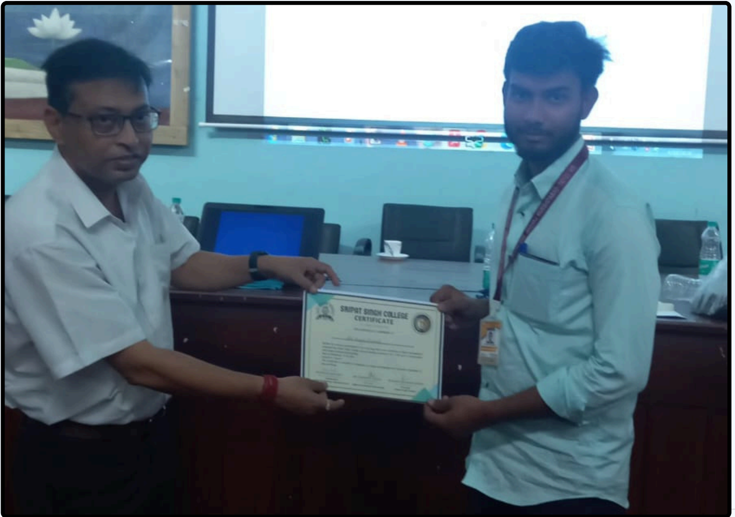
Glimpses of moment