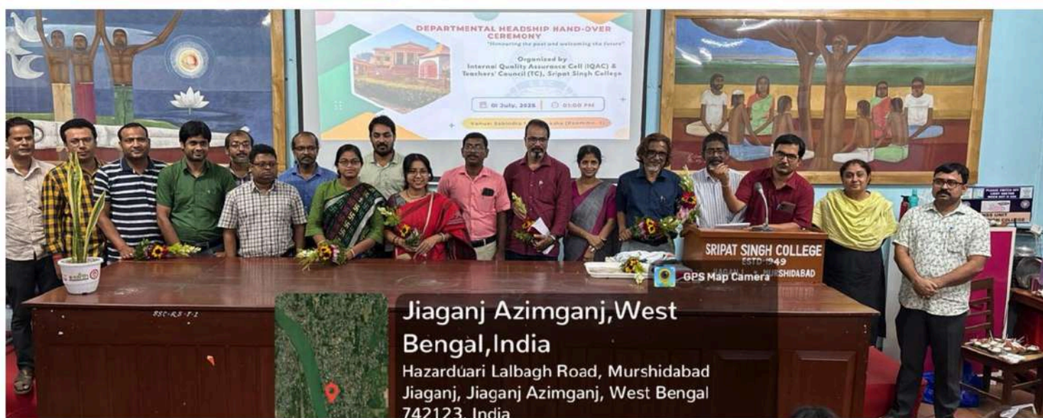
Group Photo of Former and Present Heads of Department