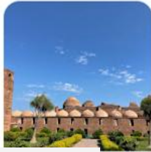
Katra Masjid ID