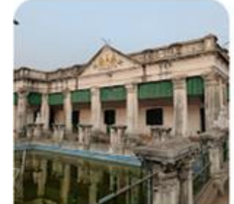
House of Jagat Seth