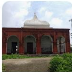
Shree Kiriteswari Shaktipeeth Temple