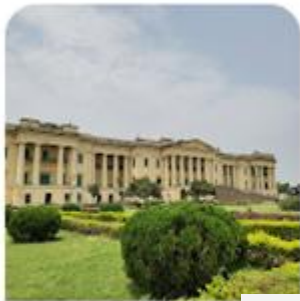
Hazarduari Palace & Museum