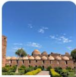
Katra Masjid ID