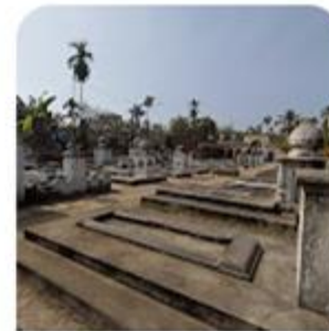
Jafraganj Cemetery (1100...