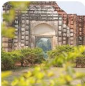
Tomb Of Azimunnisa Begum