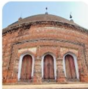
Char Bangla Temple