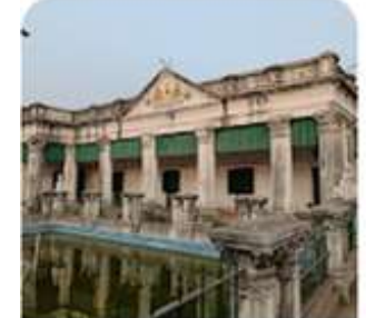
House of Jagat Seth