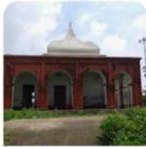
Shree Kiriteswari Shaktipeeth Temple