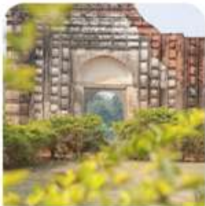
Tomb Of Azimunnisa Begum