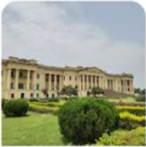
Hazarduari Palace & Museum