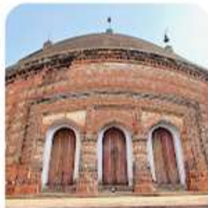
Char Bangla Temple