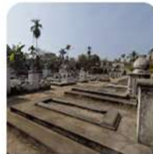
Jafraganj Cemetery (1100...