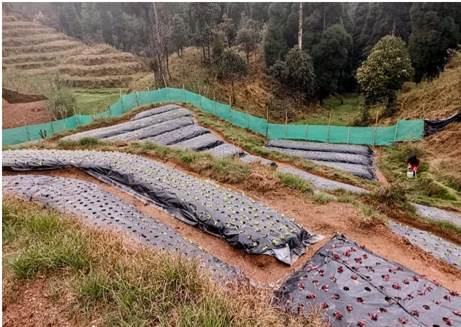
Study of organic farming at Ichhagaon