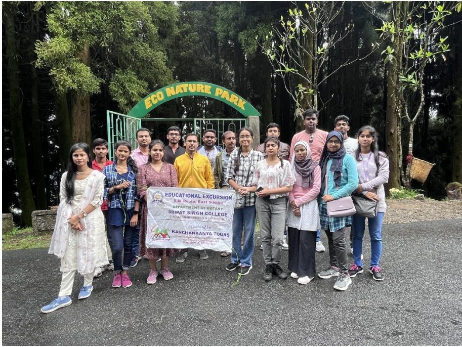
Visit to Eco Nature Park