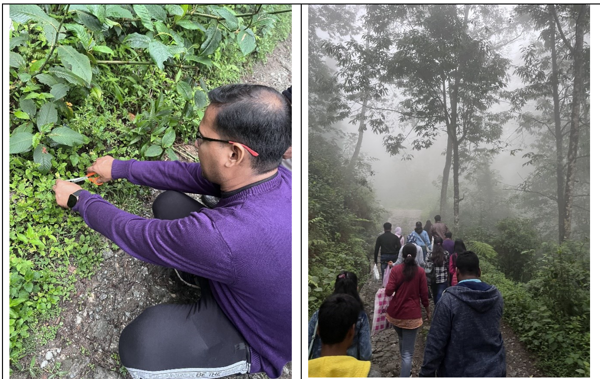
Study of plant biodiversity.