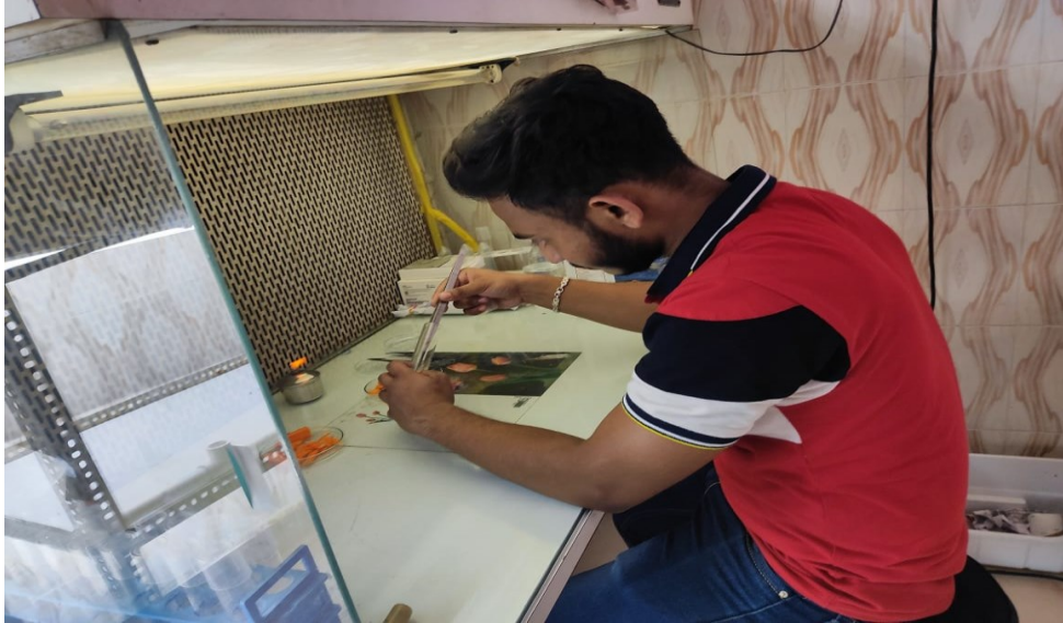
Students learning inoculation technique.