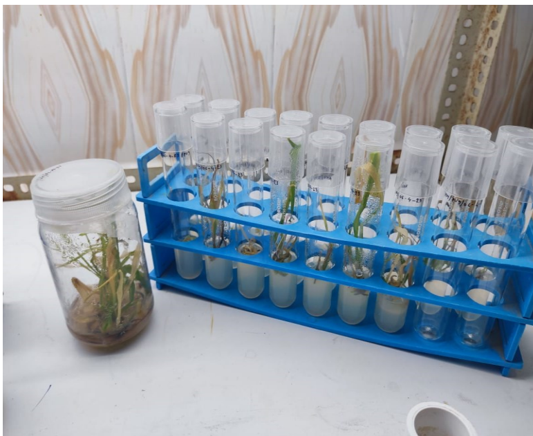
Micro propagated plants.