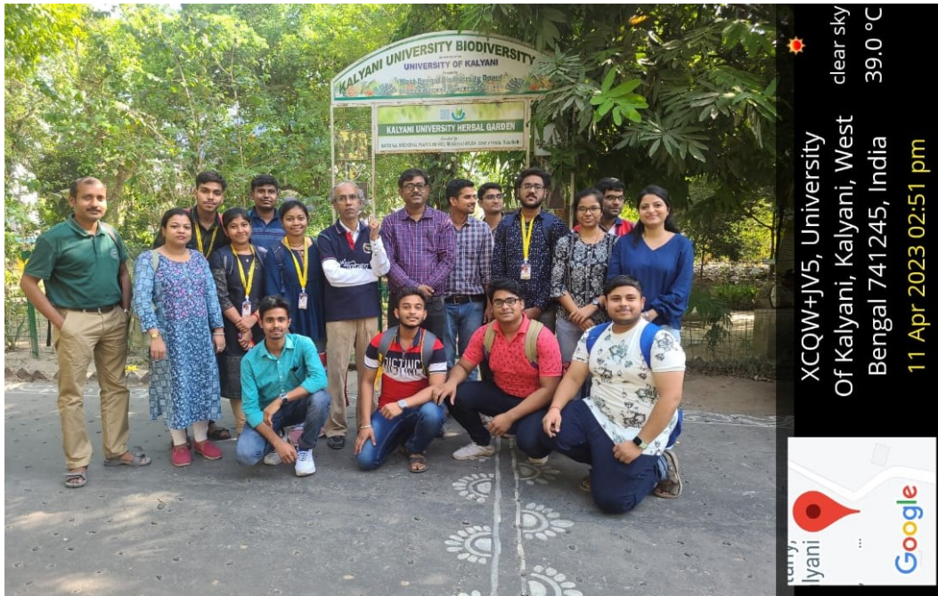
Students with respected teachers of Department of Botany, University of Kalyani.