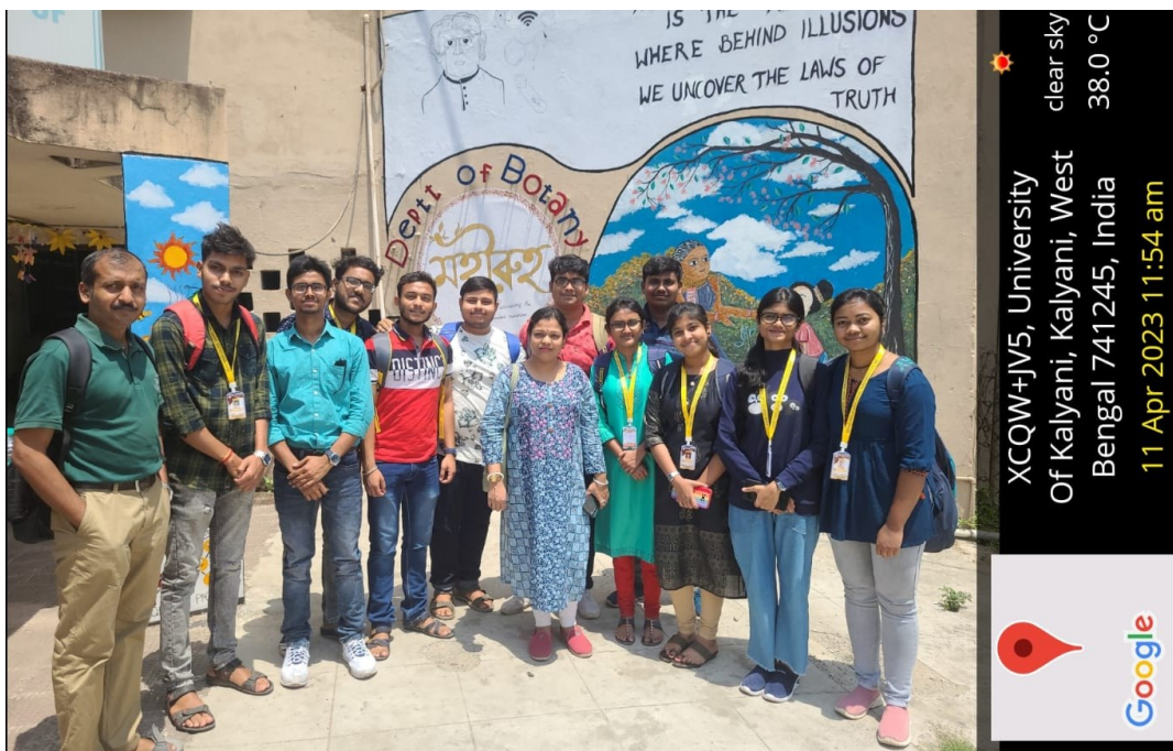
Students along with the teachers of Department of Botany. Sripat Singh College in front of Department of Botany, University of Kalyani.